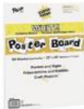
22" x 28"