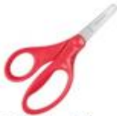
5" blunt tip (4+)