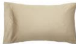
Tan pillowcase (100% cotton/standard size)