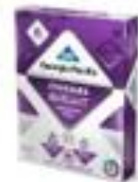
20 lb/500 sheets 8.5x11