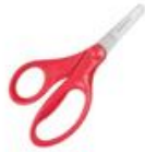
5" blunt tip. (4+)