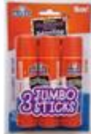
40 gr./1.4 oz.