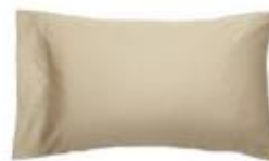
TAN pillowcase (100% cotton/standard size)