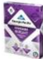
20 lb/500 sheets 8.5x11